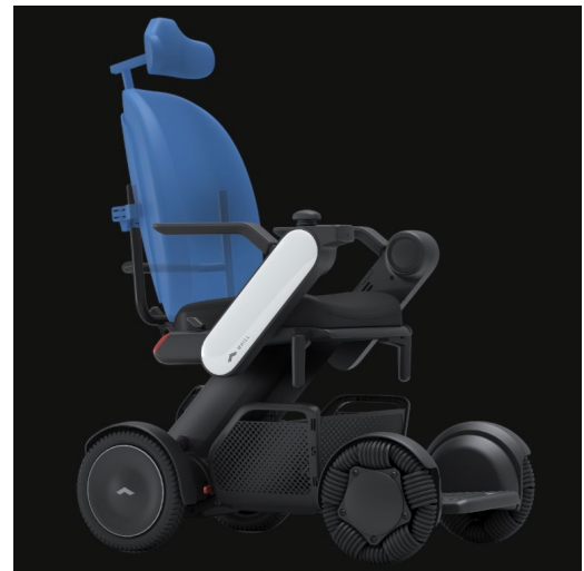
Assembled with Custom Backrest Cushion