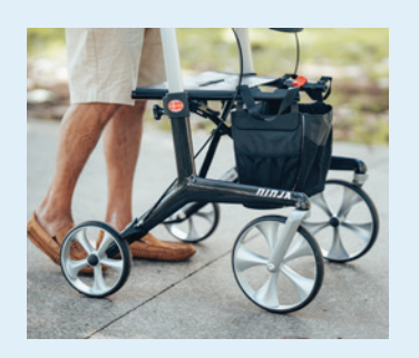
Great Outdoors The large 10" wheels provide stability and smooth movement across a variety of terrains