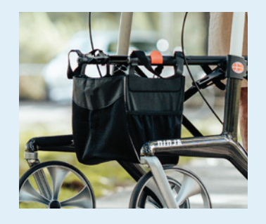
Utility Bag Holds up to 5kg, offering convenient storage for personal items