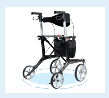
Compact Design Improves turning, offering smoother navigation in tight spaces