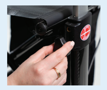
Adjustable Handles Allows for personalised positioning, helping to maintain proper posture