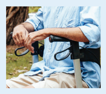
Ergonomic Handles These offer a comfortable grip during extended use. The flat-top design provides a stable resting place for arms while seated