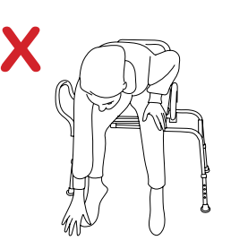
DO NOT reach or lean while sitting on the bath seat.