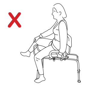
DO NOT rotate the bath seat in the direction of the support handle.