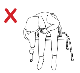
DO NOT adjust the transfer bench while seated.