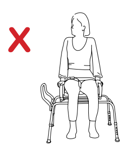
DO NOT use the bath transfer bench without adjusting the height adjustable legs to the user's height.