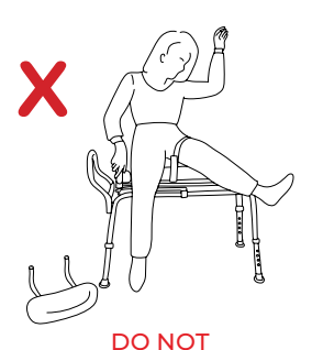
use the transfer bench without the backrest in place.