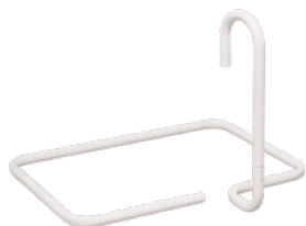
Bed Pole With Adjustable Crook Handle BEA014150