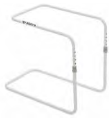
Adjustable Height Bed Cradle BEA014610