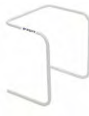
Fixed Height Bed Cradle BEA014605