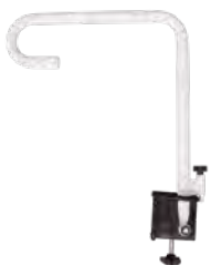
Clamp On Bed Pole BEA009300 & BEA009310